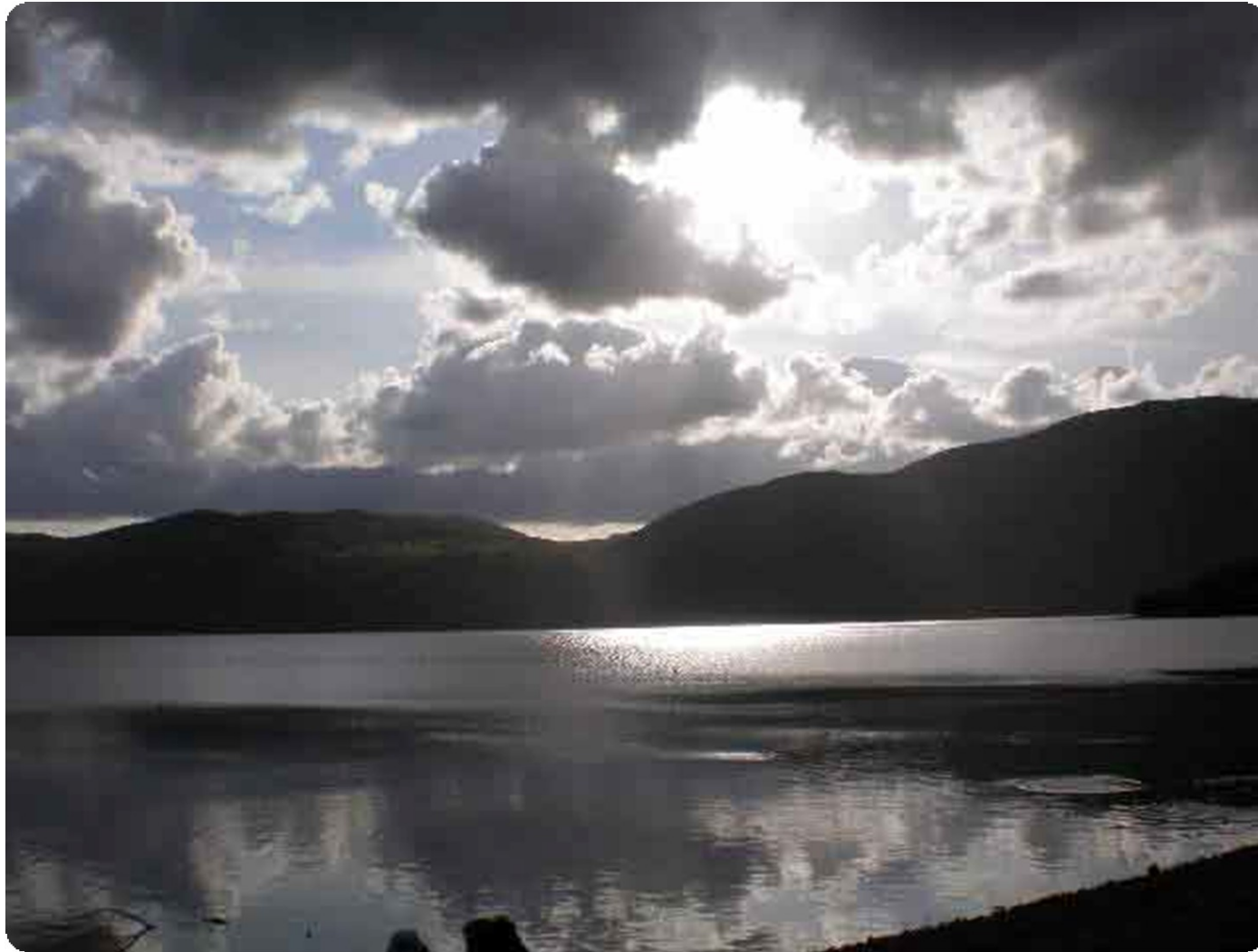
Loch Ness. Inverness (Scotland).